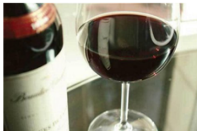
Exhibit Hall Cocktail Reception

EVENING WORKSHOPS WEDNESDAY ~ SEE WORKSHOP SCHEDULE PAGE 7